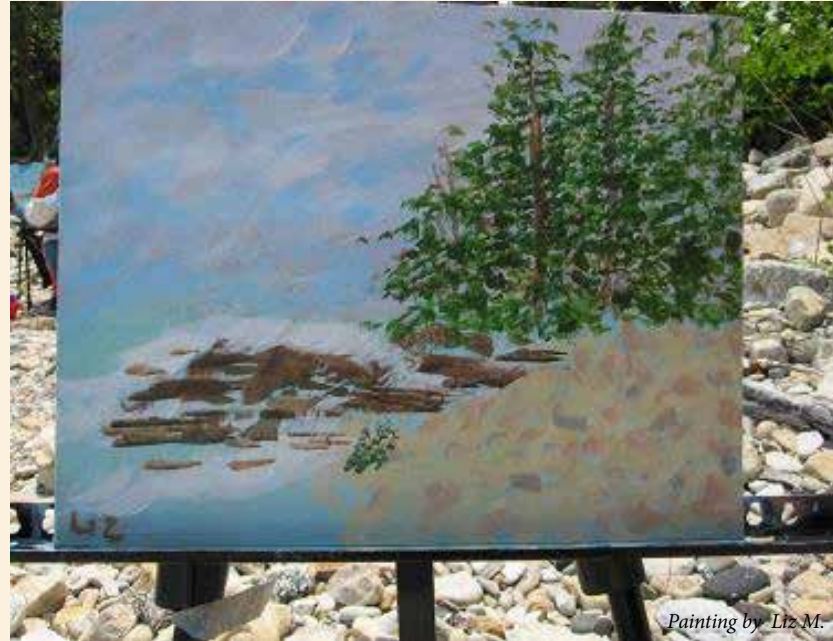
Painting by Liz M.

En plein air is a French expression which means “in the open air” and is particularly used to describe the act of painting outdoors, which is also called peinture sur le motif (“painting of the object(s) or what the eye actually sees”) in French. In painting, “sur le motif” reproduces the actual visual conditions seen at the time of the painting.