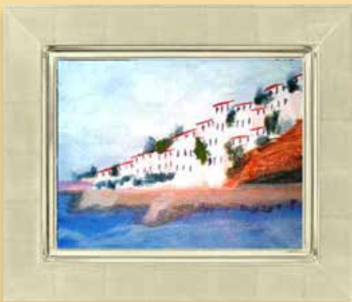
Painting by Deb G.

Session sizes range from 2 - 10 for that personal attention