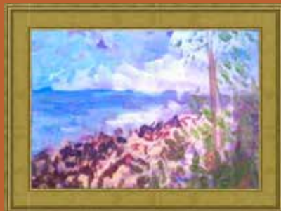
Painting by Jane L.

Session sizes range from 2 - 10 for that personal attention